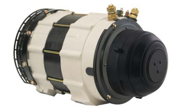
With Air Precleaner (as supplied)